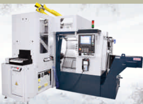
Available with automation