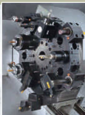
Turret VDI150 of TC800-MC