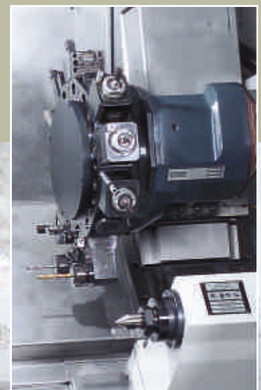
Y axis fully integrated in the machine bed