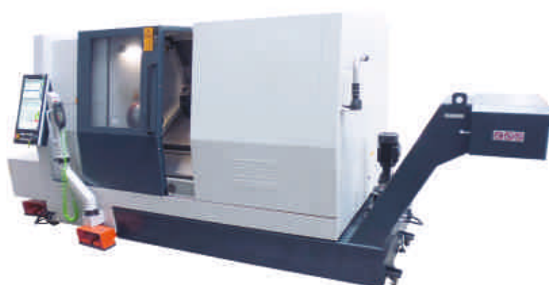
Machine bed TC600